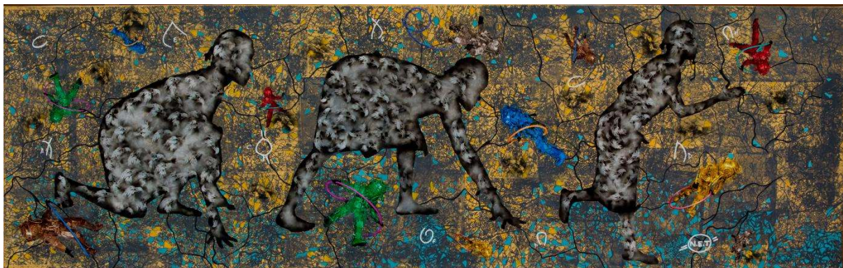
Memory of today, Memory of the future by the N.E.T collective

The Artwork, Memory of today, Memory of the future , is a monumental canvas that evokes the Africa of yesterday and today committed to a common future. With the collective N.E.T, it is the whole continent that is projected in this canvas. This work reminds us how much the earth and space are in fusion and live together.